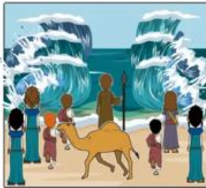
The parting of the Red Sea

As soon as the Egyptians were getting closer to the Israelites, Moses waved his staff on the water and the Red Sea parted creating a path to walk on, shortly after they went across, the Egyptians went after them. The sea collapsed and drowned the Egyptian soldiers.