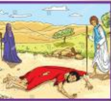
The Good Samaritan