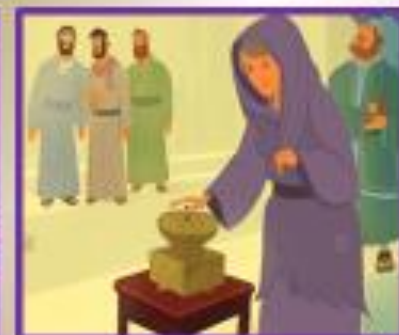
The Widow's Mite