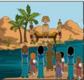
Moses leads the Israelites out of Egypt - the chase

After the death of his son, Pharaoh was living in grief. He said, "Take your people and go!" So as Moses led the Israelites out of Egypt, Pharaoh felt he had made the wrong decision and decided to chase after them with his army.