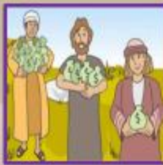
Parable of the Talents