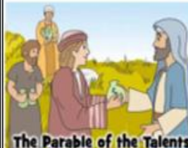
The Parable of the Talents

One day, Jesus told a story to teach people to use their gifts. A man was going on a long journey.